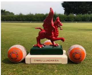
London Welsh Bowls Dragon

A friendly mid-week fixture on Wednesday 13 th August saw Hampton BC hosting London Welsh for the first time.